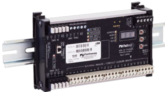
Model shown: PWINF DIN A2D