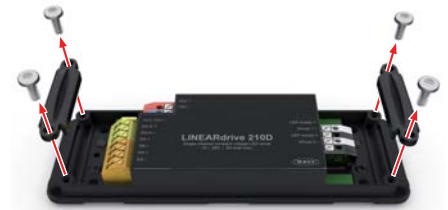
C Removing the strain reliefs