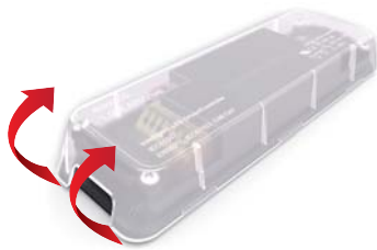
A Removing the cover