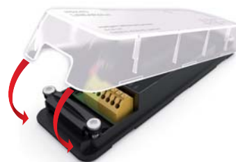
F Replacing the cover