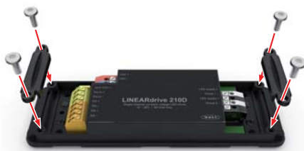
E Fastening the strain reliefs