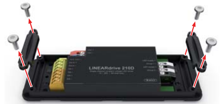
C Removing the strain reliefs