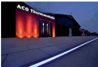
Project ACO Thormannshalle, Büdelsdorf